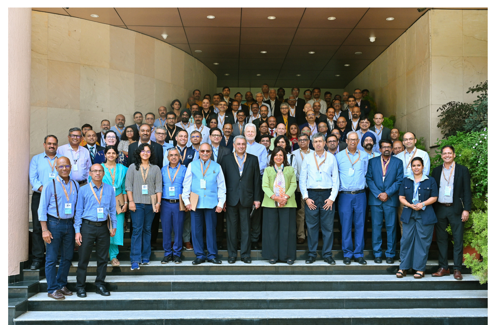
Delegates at Biocon campus, Bengaluru

More than 60 delegates from large corporations, MSMEs and academia observed that at Biocon, a quality mindset is deeply embedded in the fabric of the organization. From leadership to shop floor, teams demonstrated an unwavering commitment to continuous improvement, scientific rigor, and compliance.