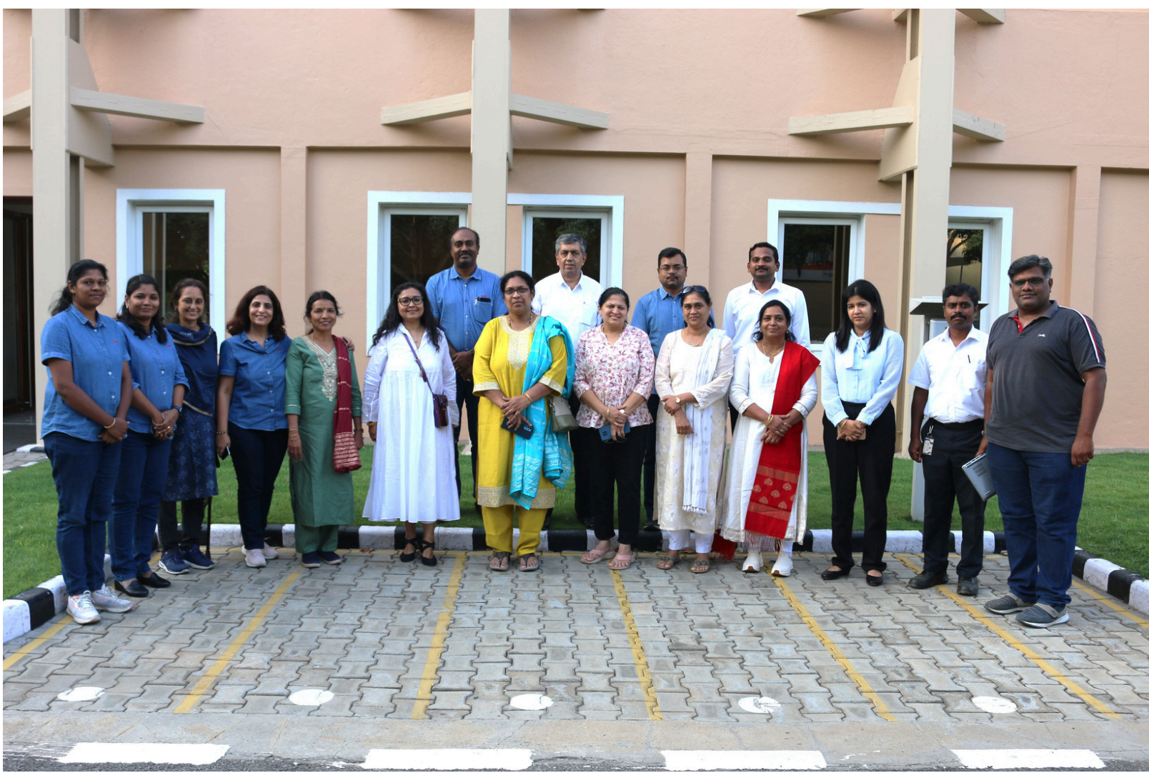
Spouses of IFQM Employees hosted at the TVS Motor factory in Hosur, Tamil Nadu

The visit to TVS Motor’s facility offered a powerful view of how quality is woven into every aspect of the organization. Kaizen practices have extended beyond the shop floor, with employees’ families and children also participating in improvement initiatives, reflecting a culture of continuous learning and ownership. Inside the plant, participants witnessed advanced automation, digital systems, and robotics at work in a space that was clean, well-lit, and thoughtfully designed. It challenged traditional ideas of factory environments and left a lasting impression of professionalism, discipline, and a company deeply committed to excellence.