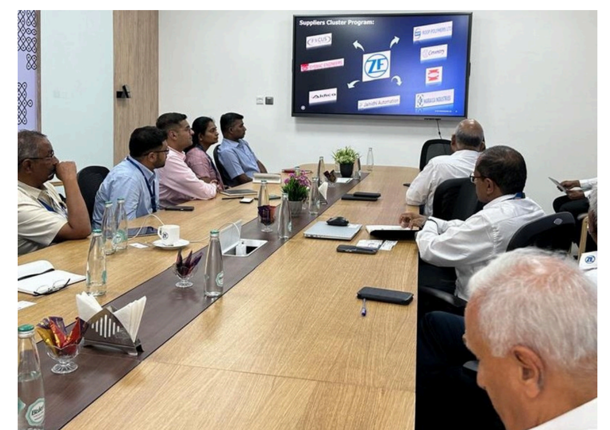
MSME Cluster program launch at ZF India

A tailored roadmap is then created based on each company's unique needs. These clusters will support in developing a large set of Indian MSMEs as Export Capable and Globally Competitive.