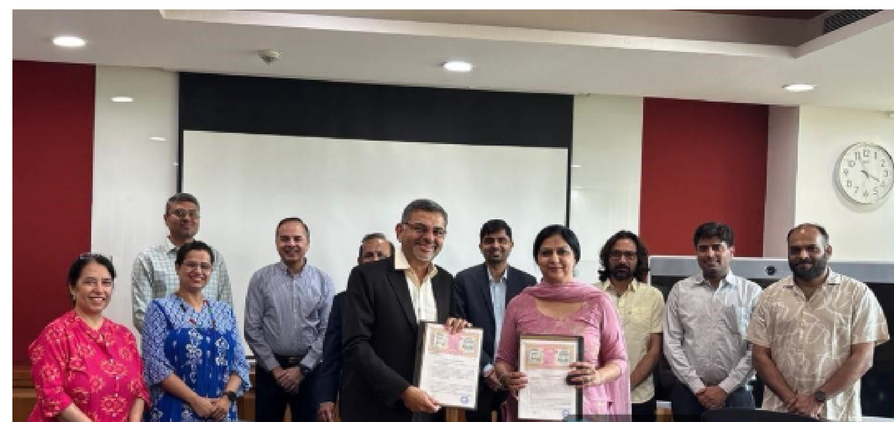
IFQM and BMU team at MOU Signing event

Taking the industry academia connect further, IFQM entered into a strategic MoU to collaboratively advance quality-focused initiatives. The partnership aims to embed a strong culture of quality among students by integrating quality management, research, education, and training into the academic framework.